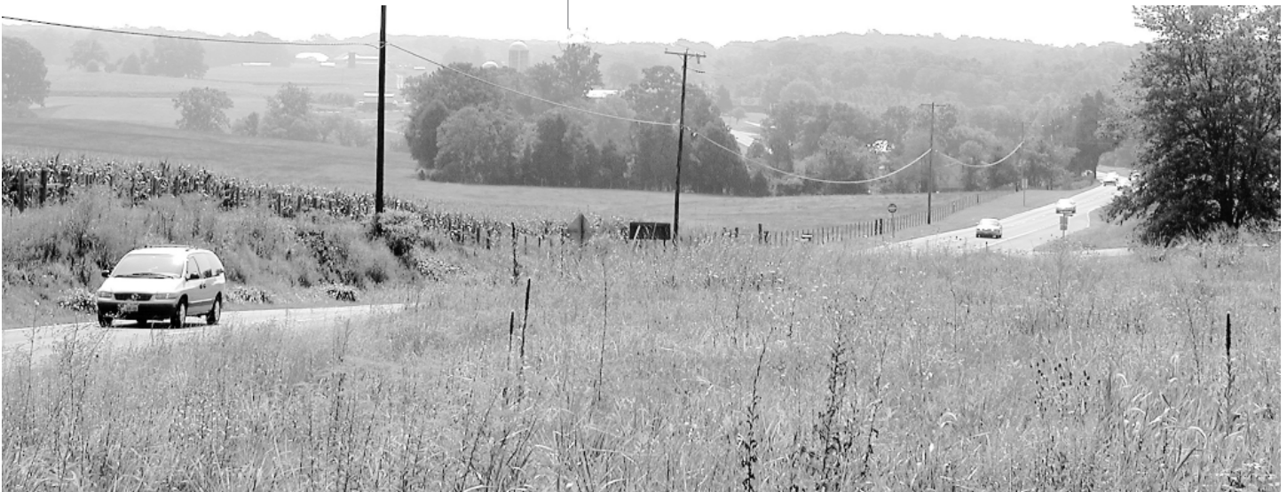
Much of the May 1st battle was fought on the rolling ground in the photo above. A coalition has been formed to oppose the proposed development of this battlefield.