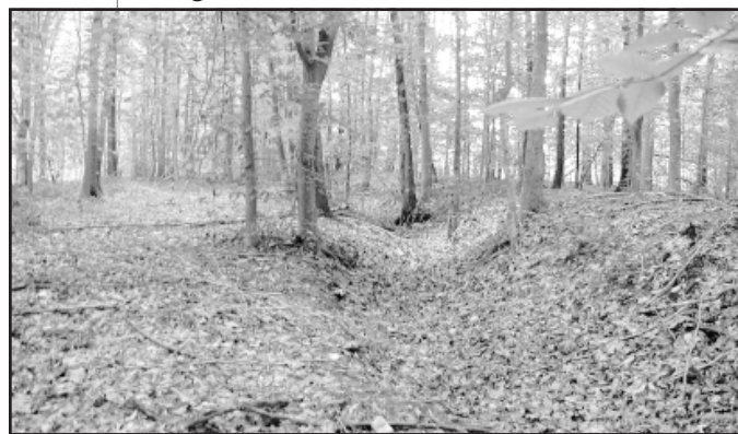
These Confederate earthworks in Spotsylvania Court House Battlefield have been preserved through the generosity of our members.

We are actively seeking additional acreage on each of these battlefields. It should be evident that the greatest threat is on State Route 3, which runs through the heart of Chancellorsville. The May 1 battlefield that developers are seeking to get rezoned is also along this historic corridor.