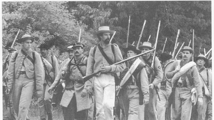
Preservation marchers recreating Jackson's Flank Attack March on Saturday, May 2nd.