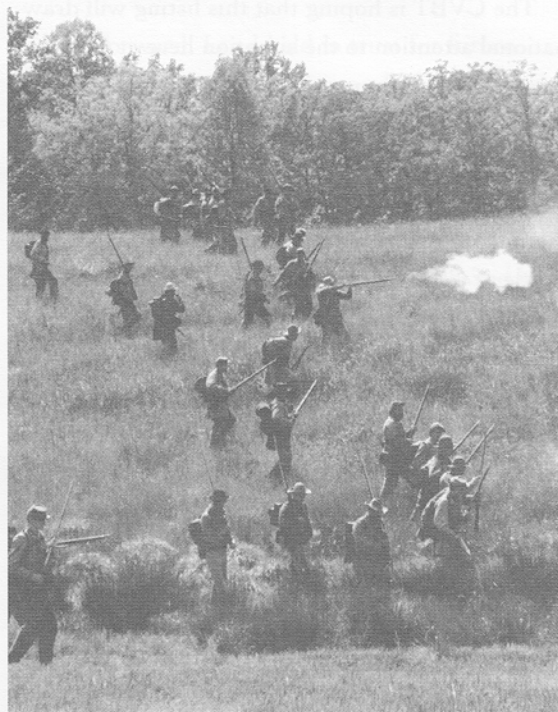
Infantry demonstrating tactics used during the Civil War.

began. The gates opened at 10 a.m. with cars streaming onto the McLaws' Wedge property. More than 3,000 people visited and enjoyed the living history program. Everything from infantry demonstrations to children's programs made it a fun filled and educational time for the entire family. The crowd bravely stood their ground as Confederate troops charged in a mock infantry