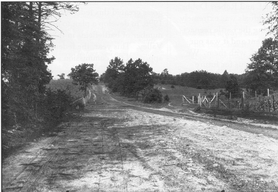
An 1890's photo looking west on the Orange Turnpike towards the Talley Farm. The ridge at the distance is the Talley Ridge where Jackson attacked the Union army.